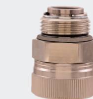
L-FS19 (Straight Swivel 3/4")